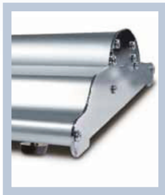
A stable design with feet that compensate for uneven surfaces.