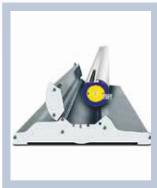
The image is well protected during transportation.

Roll Up Classic is easy to transport and assembles in a flash for your presentation. Roll Up Classic is available in a wide range of widths and is ideal for repeated use in different environments.