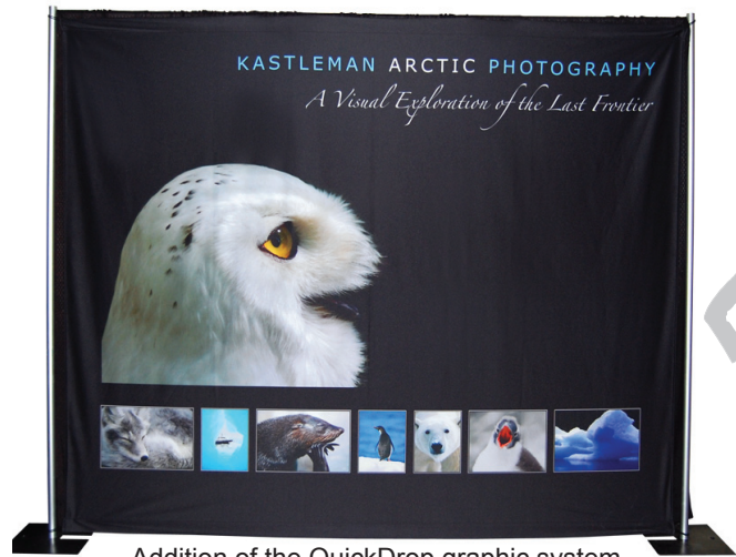
Addition of the QuickDrop graphic system Shown on typical exhibit hall pipe & drape - Not Included.

Trade shows do not get any easier than this. Travel to and from your next trade show with a single 13" x 19" / 6lb bag. Designed to attach directly to an exhibit supplied pipe and drape system, QuickDrop is simply the fastest most convenient solution.