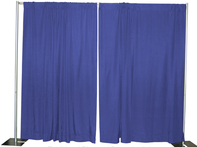
Traditional Pipe and Drape backdrop