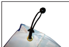
Ball Bungee attached to graphic.