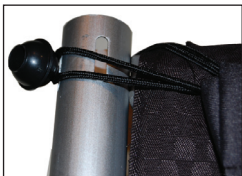
Graphic attached to pipe and drape.

Either by using the supplied ball bungees and hooks or by utilizing the top pole on any pipe and drape structure QuickDrop is simple, convenient, economical and a super traveler. As fast as the QuickDrop is put up it can be taken down, folded up and your off to meet the next opportunity or catch an early flight.