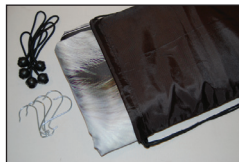
Black carry bag, bungees and hooks.