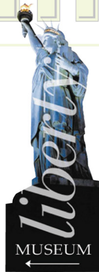
24" x 60" profile