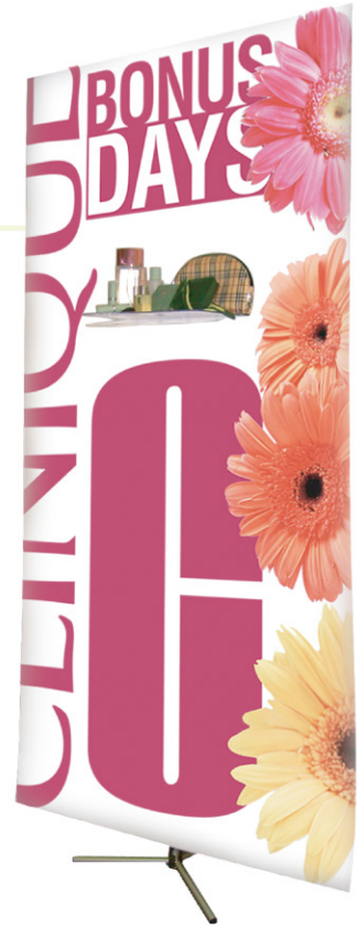
47.25" X 94" with fixture adapter