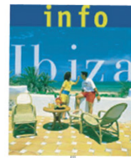
combination graphic and literature holder