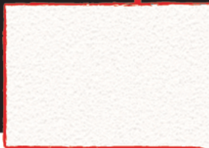
Nassau Dunes - has a pitted texture with a moderately flat touch.