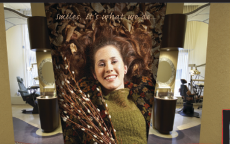
Exciting Interior Spaces

Contact the installer of your choice before ordering. This will help assure you will have the most accurate information needed to order and produce your wallcovering to determine roll width preference and any other pertinent installation specific details. Check your local Yellow Pages for professional Paperhangers.