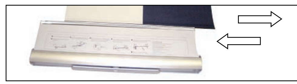
The strip on the bottom of the graphic, slides off the strip attached to the leader. The replacement graphic slides on easily.

Carefully secure the top of the newly attached graphic - preferably have someone hold it tightly - so you can remove the locking pin from the side and slowly feed the new graphic into the base.