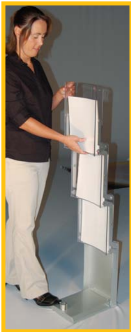
3. With your foot placed on the base, lift literature holder upward from behind until it snaps into place.