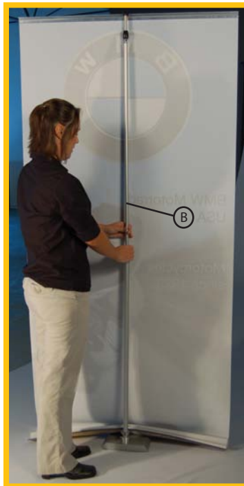
6. Extend graphic upwards by raising the top then middle sections of the adjustable mast B .