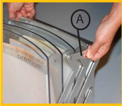
1. Pull out on the tabs A to release the clips on the adjustable lit holder.