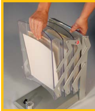
2. Expand the adjustable literature holder slightly.