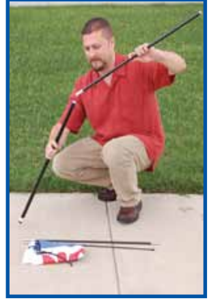
Place stake into ground. Assemble mast. Thickest Slide Mast into pocket at With mast inside banner,