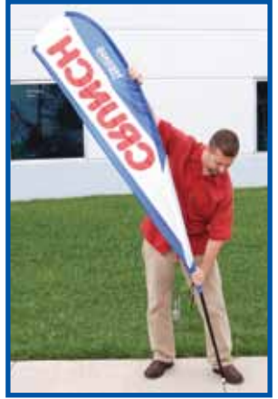
Slide banner over length of mast. Use your foot to brace the mast against the ground or floor.