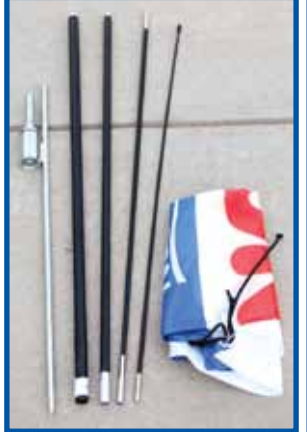
Stake, four piece mast and banner (drop shape shown in example)