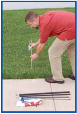
If required a hammer can section to thinnest. be used to gently tap the stake into the ground.