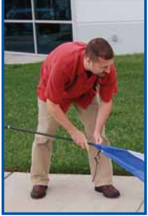
bottom of banner. Bottom pull banner downward so of banner will have a black tip of mast meets end of cord with a silver clip.