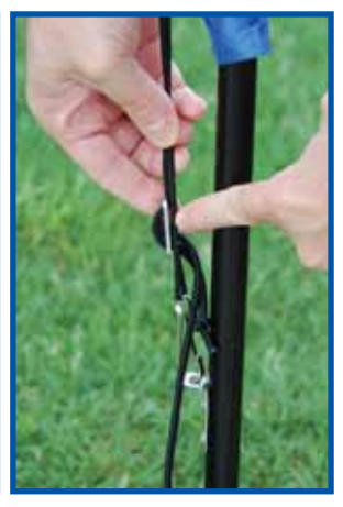
Lengthen or shorten cord To break down, repeat length to adjust tension on steps in reverse. banner as needed.